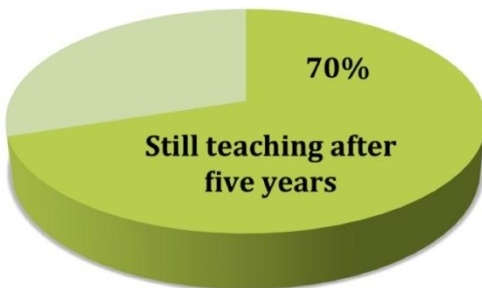
California Teacher Corps Teacher Retention

Source: California Commission on Teacher Credentialing